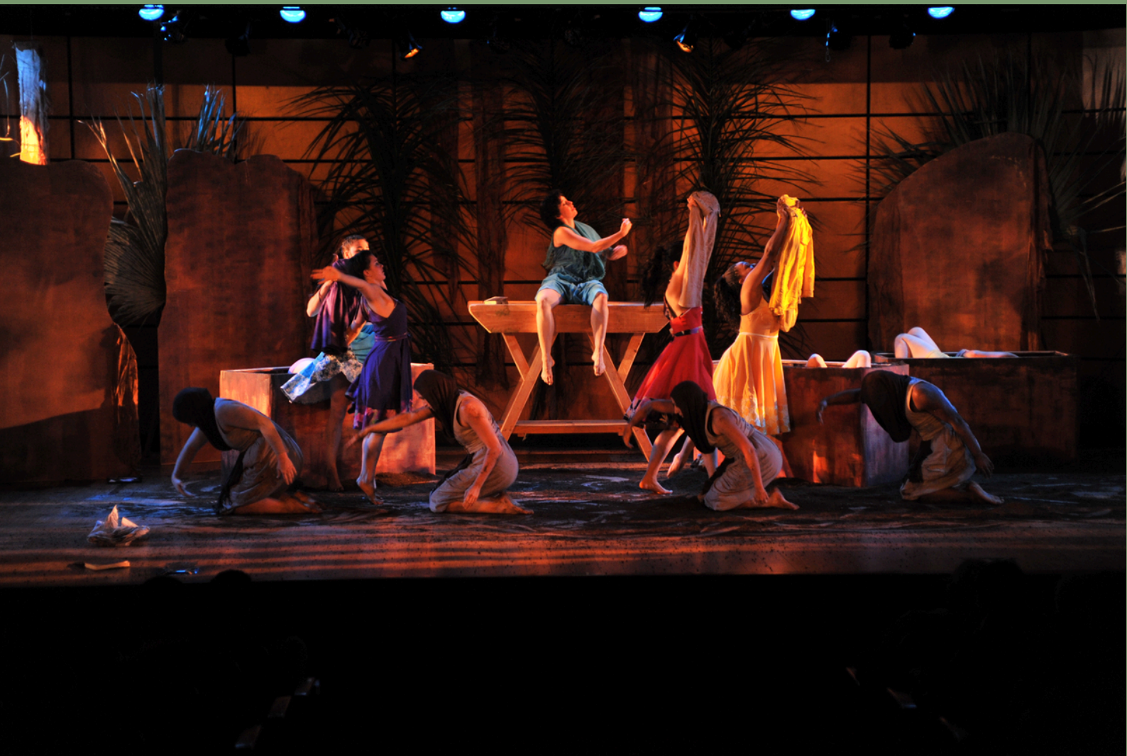
CENTRO CULTURAL MAURICIO BAEZ IN SANTO DOMINGO, DOMINICAN REPUBLIC, THURSDAY DECEMBER 1, 2011.

Broadly, sustainability is an intersectional space not just about the environment, but about the relationship between humans and the environment. Caring about humans is caring about the environment and caring about the environment is caring about humans. About the intersection of all those things not just about STEM approaches.